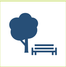
Outdoor Spaces and Buildings

The World Health Organisation (WHO) have identified eight ‘domains’ each of which should be looked at through the lens of age-friendliness in order to ensure equality of access to services.