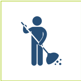
Civic Participation and Employment