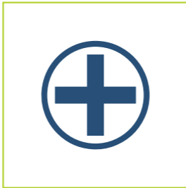
Community and Health Services

This toolkit has been designed to help other people to develop their own friendship groups, and the things to consider and ensure when doing so. It also includes case studies and testimonials from both volunteers and members of these groups to highlight the positive impact these groups create.