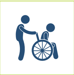
Respect and Social Inclusion