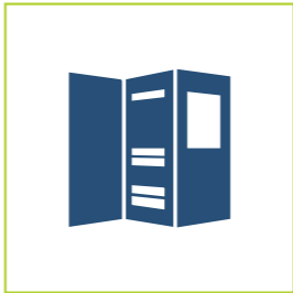
Communication and Information